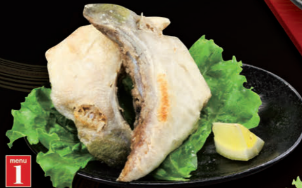
menu 1 Yellowtail Cheek $4.20