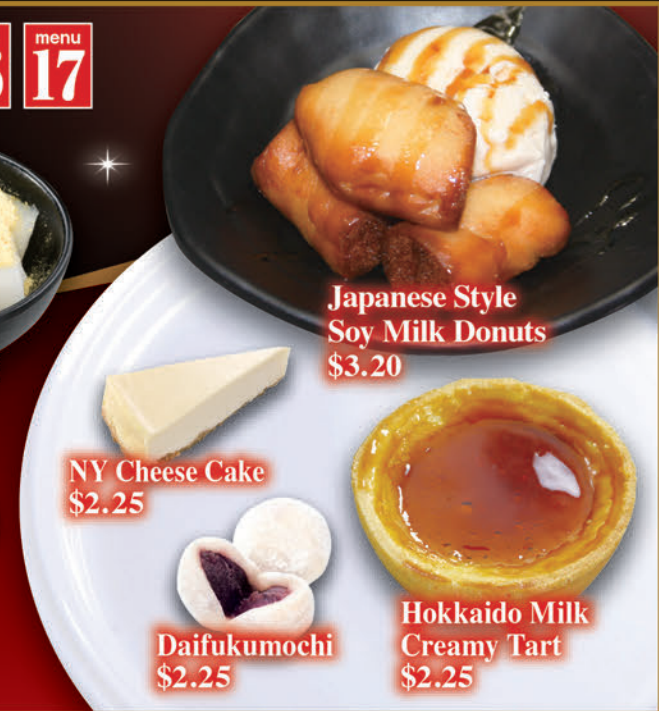
Japanese Style Soy Milk Donuts $3.20