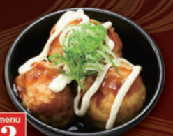
menu 3 Fried TAKOYAKI $2.25