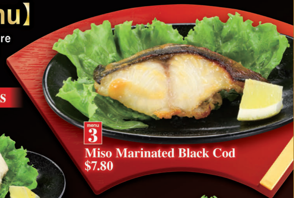
menu 3 Miso Marinated Black Cod $7.80