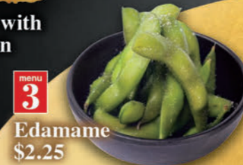
menu 3 Edamame $2.25