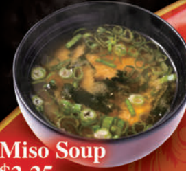
Miso Soup $2.25

Our finest dashi broth is freshly made every day. It is served at its best quality!