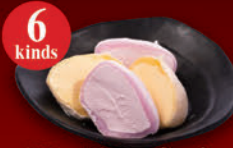
Mochi Ice Series $3.20

*Choose 2 flavors from the following: Green Tea, Mango or Strawberry