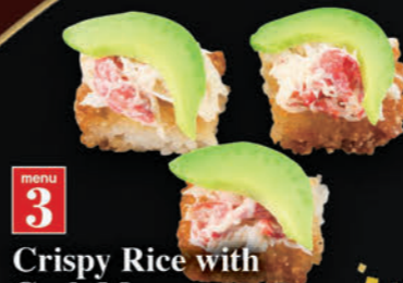
menu 3 Crispy Rice with Crab Mayo $2.25