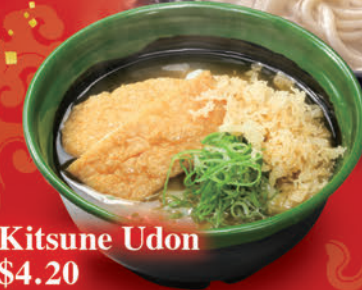
Kitsune Udon $4.20