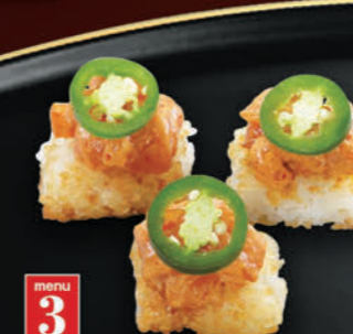
menu 3 Crispy Rice with Spicy Salmon $2.25