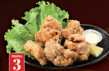
menu 3 Crispy Chicken $3.20