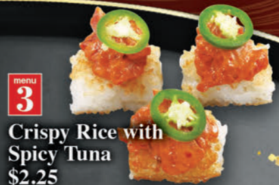
menu 3 Crispy Rice with Spicy Tuna $2.25