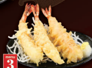
menu 3 Shrimp Tempura $4.20