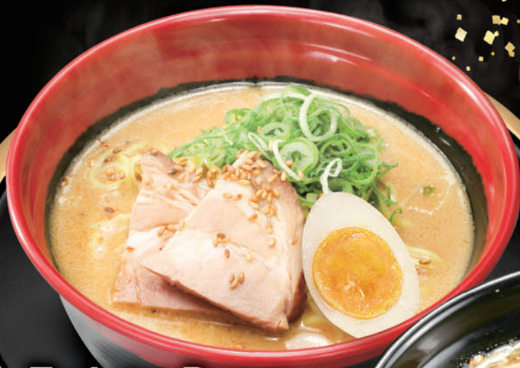
Tonkotsu Ramen $5.80

Thick and chewy noodles perfectly match our homemade soup!