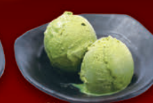
Green Tea Ice Cream $2.25