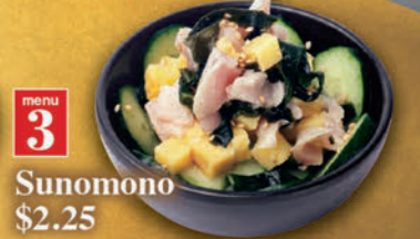
menu 3 Sunomono $2.25