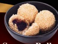
Sesame Ball $2.25

Don't forget to end your meal with some sweets!