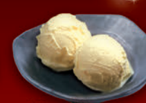
Vanilla Ice Cream $2.25

*Choose 2 flavors from the following: Green Tea, Mango or Strawberry