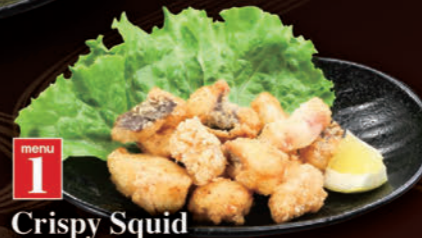
menu 1 Crispy Squid $3.20