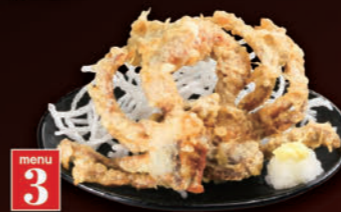
menu 3 Softshell Crab Tempura $4.20