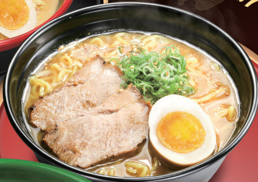
Miso Ramen $5.80

Enjoy the flavorful soup with the aroma of sesame seeds.