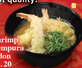
Shrimp Tempura Udon $5.20