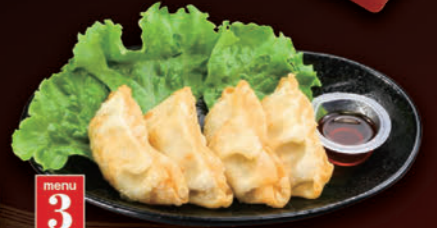
menu 3 Chicken Gyoza Dumpling $3.20