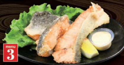
menu 3 Salmon Cheek $3.20