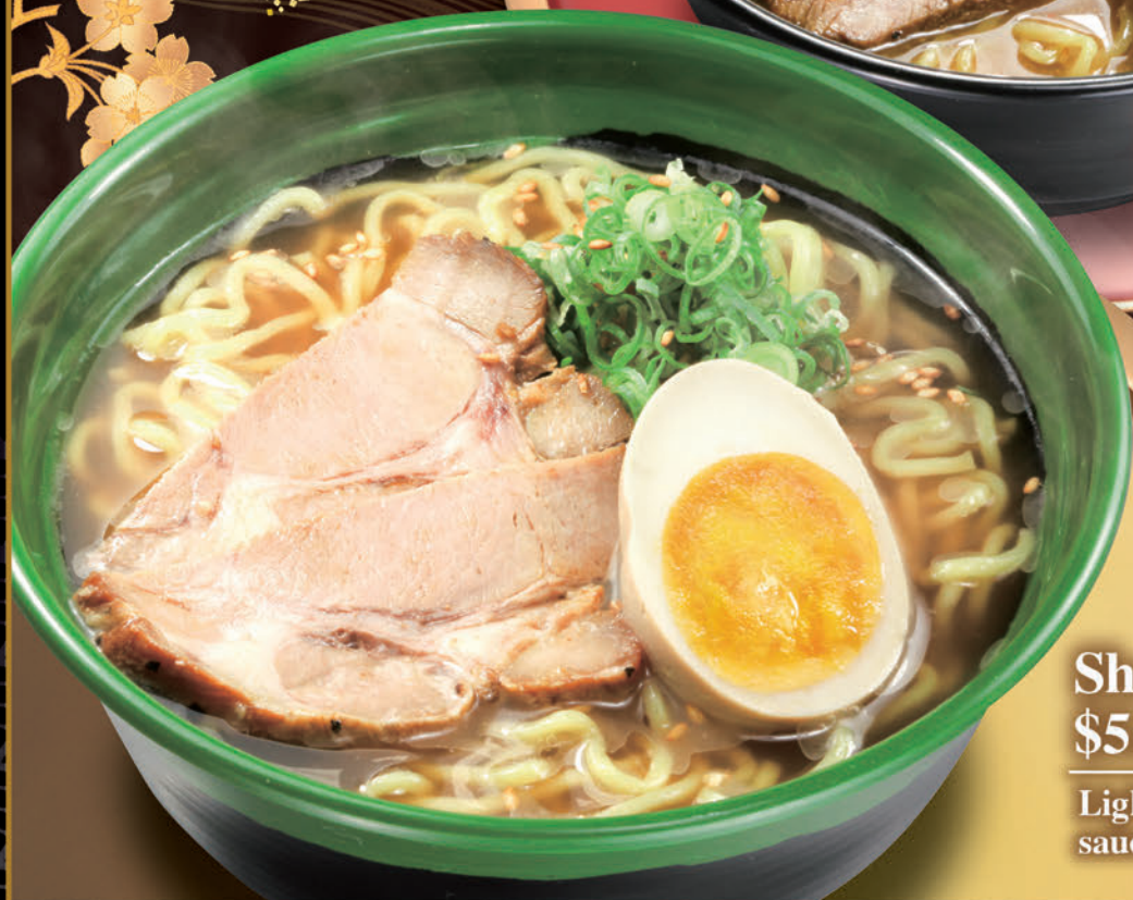
Shoyu Ramen $5.80

Miso-based soup has a rich flavor and excellent savory.